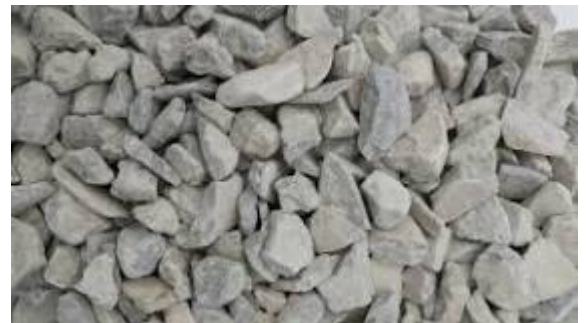
6C drainage aggregate