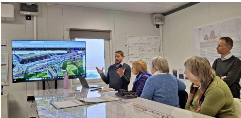
Extensive site briefing by Sisk

As will have become obvious this all adds up to a major project for any construction company with Sisk employing some 60–100 persons on site-works together with 30 admin staff and engineers. For North Yorkshire CC this new road has become their most ambitious, environmentally difficult and costly road project to which they have ever committed. With this new road, now in the final stages of construction, recent cost estimates agreed have now reached £82 million, £50 million of which will be funded by central Government. Whilst completion of some landscaping and general maintenance work will continue until mid-2027, the good news from the contractor was that they are hopeful the new road will finally open for first traffic by the end of June 2026.