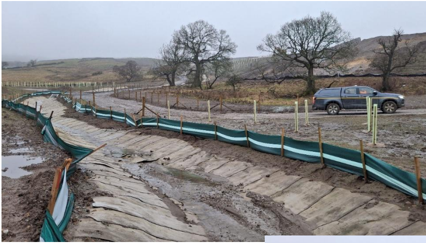
Kex Gill site visit to new road start near Blubberhouses

Kex Gill site visit - new drainage and tree planting in progress